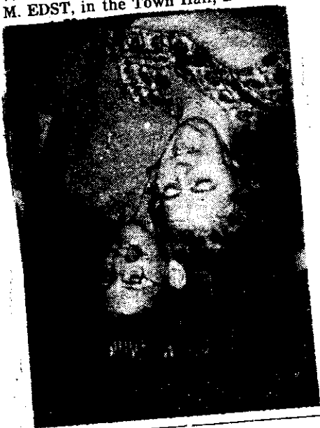
Junior Olympic trials will take place at 2 o'clock tomorrow (left)

NOTICE TO CONTRACTORS NOTICE IS HEREBY GIVEN that pursuant to a resolution of the Town Board of Cheektowaga, Erie County, New York, sealed pro- posals will be received and consid- ered by said Town Board on the 7th day of August, 1961, at 2:30 P. M. EDST, in the Town Hall, Broad-